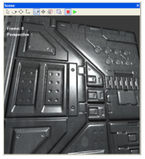
Fig. 9 – With normalization

The only problem with renormalization is that it can cause aliasing of specular highlights. These artifacts are particularly noticeable when the viewpoint is moving. One solution to this problem is described in the NVIDIA paper "Mipmapping Normal Maps", which is available on the developer website.