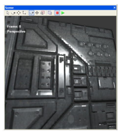
Fig 2. DXT1 compression