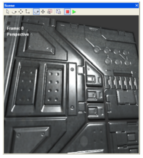
Fig. 7 – A8L8 format with generated Z

Note that generating the Z component actually produces better results than the uncompressed normal map, because it generates a normal that is always unit length.