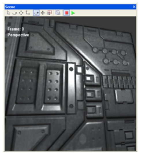
Fig. 6 – Uncompressed