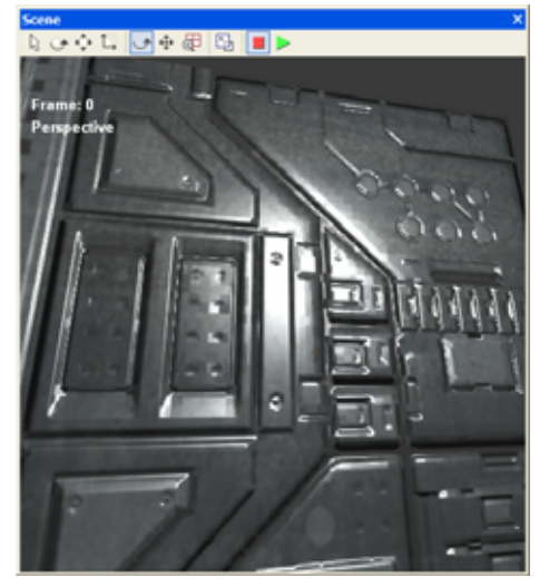
Fig 3. DXT1 compression with renormalization