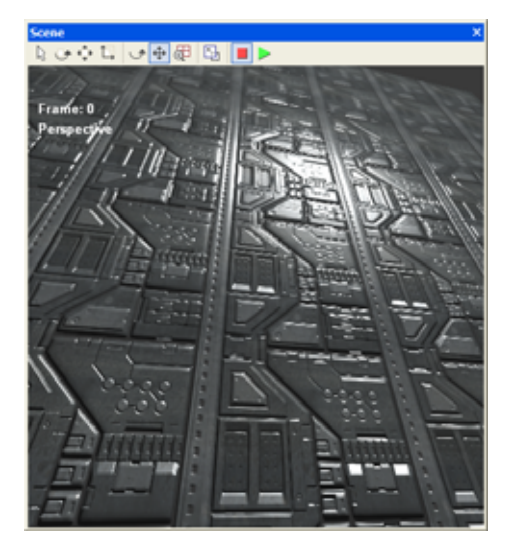
Fig.10 – Bump map showing specular aliasing

This technique uses the denormalization of normal vectors caused by interpolation as a measure of the minification of the texture. It uses this value to dim and broaden the size of the specular highlight to reduce aliasing. Note that this means this technique is incompatible with 2 component normal map formats that derive the Z component in the shader, since in this case the normals will always have a length of one.