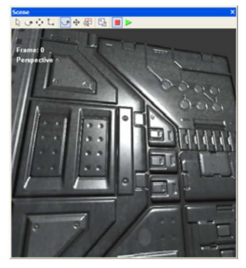
Fig 12. Tangent space bump mapping

It is also possible to use just a single channel heightfield as the bump map representation, and then use 3 texture lookups to estimate the gradients based on the neighboring heights. This is probably the most efficient bump map storage format, but requires a significant amount of work in the shader.