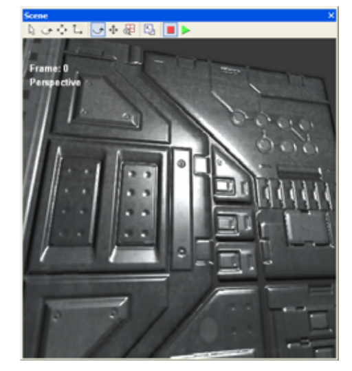
Fig 5. DX5 with generated Z