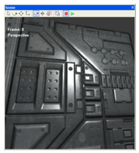
Fig 1. Uncompressed

The DXT1 format compresses RGB images by a factor of 6:1, for an average of 4 bits per texel. Unfortunately DXT1 does not usually produce good results for normal maps. The artifacts can be seen below in the form of rectangular blocks along high-contrast edges. Renormalizing the normal after the texture fetch improves the quality slightly, but the results are not acceptable for most bump maps.