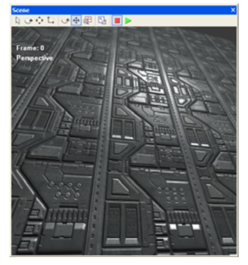
Fig 11. With "Toksvig" factor