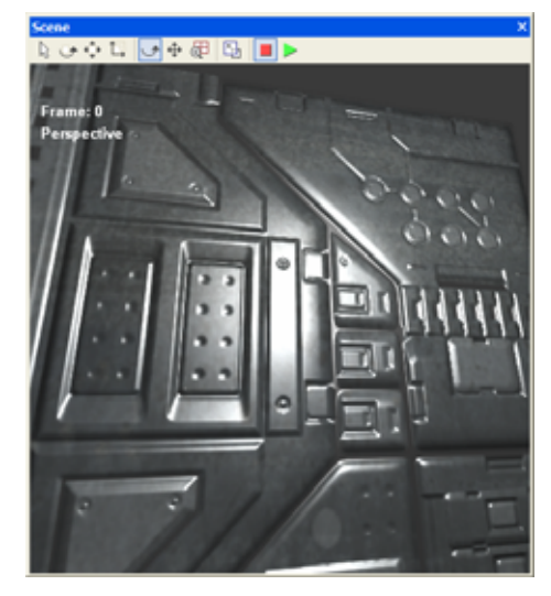
Fig 13. Blinn-style bump mapping