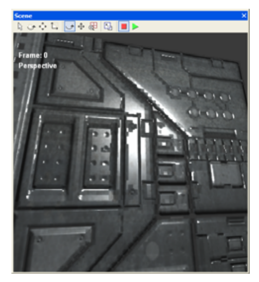
Fig 4. DXT5 compression

It may be possible to store other unrelated data in the spare channels of the DXT format. For example, if you have monochrome gloss and shininess maps, you could store these in the red and blue channels. If you are not using all the channels in a DXT format, it is best to zero out the unused color channels since this gives the compressor more flexibility in choosing the closest colors.