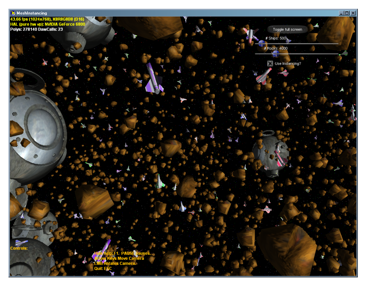
Figure #: Shot of NVSDK Instancing Sample

Now that we've covered all the basics; let's dissect a slightly more complex example. This example was written as a demo for the instancing functionality. As you can see from the screen shot below; it consists of a space scene filled with asteroids and space ships. This sample uses the DX Instancing API as described to reduce the # of draw calls and increase performance.