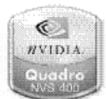
NVIDIA Quadro NVS model badge